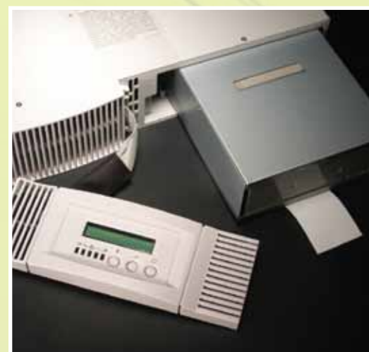
The Supercapacitor UPS Supergreen Energy Storage