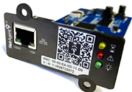
SNMP / Webcard