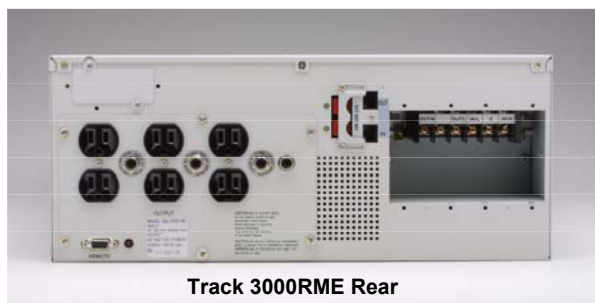
Track 3000RME Rear

NOTE: Standard models come with LED display and designated 'T' or 'RM' e.g. Track 3000T Extended models come with LCD display and are designated 'TE' or 'RME' e.g. Track 3000TE