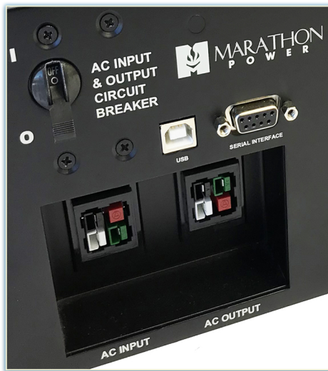
RECESSED ANDERSON INPUT / OUTPUT CONNECTORS