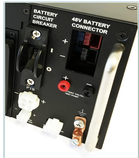
BATTERY BREAKER AND TEST POINT