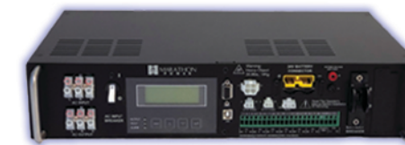
Ruggedized Traffic UPS / BBS 650VA / 650W 1100VA / 1100W