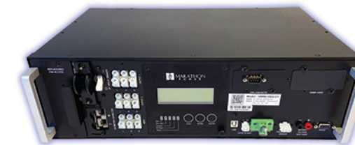
Ruggedized Vault Rackmount Series 1000VA / 700W 1500VA / 1050W

Double-conversion technology is ideal for the most critical and sensitive applications where the best level of power protection is required.