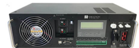
High Power Traffic UPS / BBS 2000VA / 2000W