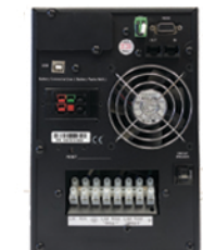
Ruggedized Vault Tower Series 700VA / 490W 1000VA / 700W 1500VA / 1050W

All models available in 120V and 230V versions. For specifications, backup times and battery options please see individual products sheets or go to marathon-power.com .