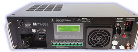
Cal Trans Approved Ruggedized Traffic UPS / BBS 2000VA / 1500W

Line-interactive Battery Backup Systems use automatic voltage regulation (AVR) to correct abnormal voltages without switching to battery.